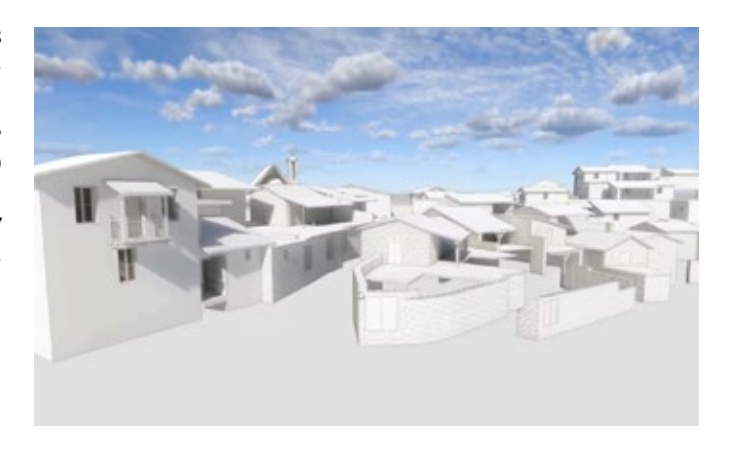
Pic. 2: Digitization process of Fikardou Village by the CUT Team

The digital documentation process employed by the CUT team commenced with data acquisition, utilising advanced technologies such as laser scanners , 360° photography , and drones to capture the details of Fikardou's built environment. This initial phase created a comprehensive digital representation of the village and facilitated subsequent data processing stages. Data preparation involved cleaning and organisation of acquired data , ensuring its suitability for analysis and interpretation.