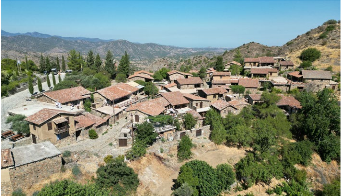
Pic 1: Fikardou Village

In 1984, a comprehensive revitalisation effort was launched, focusing on the restoration of dilapidated structures and the enhancement of the village's infrastructure. These endeavours have garnered recognition, with Fikardou now proudly listed on the tentative UNESCO World Heritage Sites roster . Notably, the restoration of key residences, such as the "Residence of Katsinioros" and the "Residence of Achilleas Dimitri," earned international acclaim, affirming the village's status as a beacon of architectural heritage.