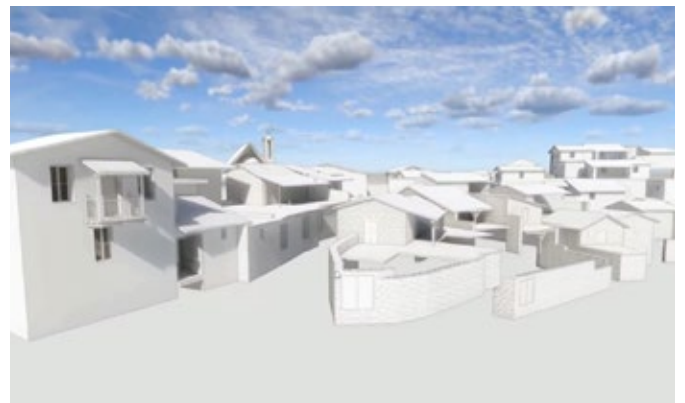
Pic. 2: Digitization process of Fikardou Village by the CUT Team

The digital documentation process employed by the CUT team commenced with data acquisition, utilising advanced technologies such as laser scanners, 360° photography, and drones to capture the details of Fikardou's built environment. This initial phase created a comprehensive digital representation of the village and facilitated subsequent data processing stages. Data preparation involved cleaning and organisation of acquired data , ensuring its suitability for analysis and interpretation.